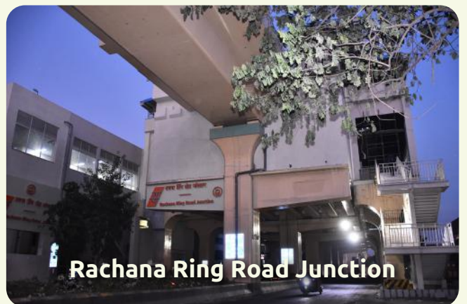
Rachana Ring Road Junction